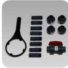
Install kit: 4 unions 8 nipples 3/4"x3" 1 ball type shut off valve 1 filter housing wrench